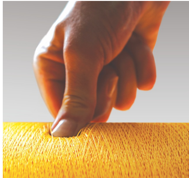
Fewer cross marks due to soft bobbins