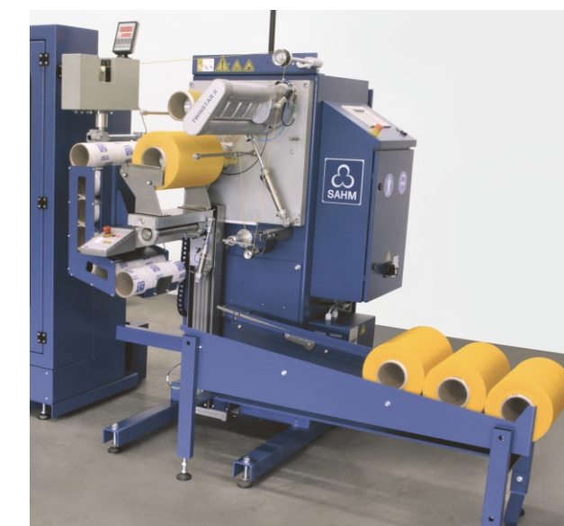
Winding and optional automation